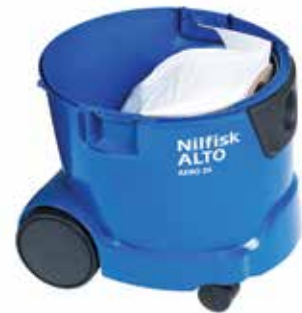
Fleece bags available for easy clean-up of debris.